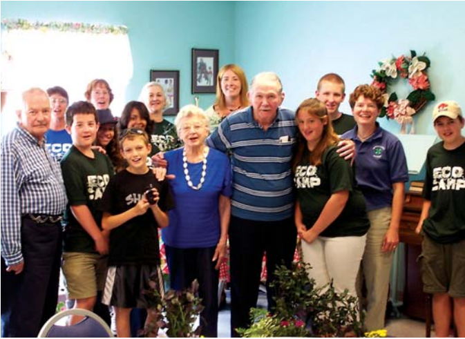
Middle School Students who attended the Environmental Careers Outdoors Camp this summer pose with Woodcrest Commons residents after planting container gardens at the senior living community.

The environment at Woodcrest Commons, a DePaul Senior Living Community in Henrietta, NY, has “brightened up” this summer thanks to Rush Henrietta Middle School Students who attended the Environmental Careers Outdoors Camp 2005 during their summer break from school.