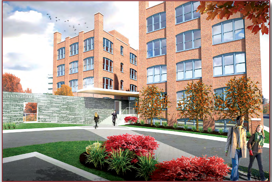
Carriage Factory Apartments

The Riverside Apartments will renovate the former Buffalo City School 60 building on Ontario Street in Buffalo. This school building has been closed for nearly ten years. The program will contain 45 licensed treatment