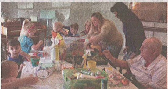
Woodcrest Commons celebrated Earth Day with the help of the Mom's Group of Henrietta.

Sports • Celebrations • Vacations • Events