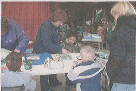
The Little Red School House from Adams Basin visited Salmon Creek Nursery to learn about plants and how they grow.