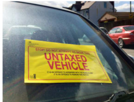
New York Launches New Policy for Cars Used Less Than 50 Miles/day