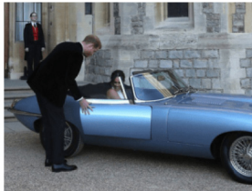
The Royal Family Spent Millions on These Luxury Cars