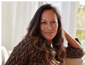
These Are the Top Financial Advisors in Rochester