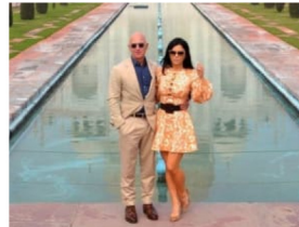
Jeff Bezos and His New Partner Live in a Mansion Larger Than a Neighborhood.