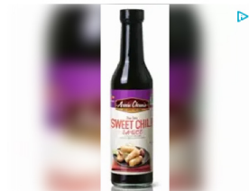
Annie Chun's Sweet Chili Sauce -- 10.9 Fl Oz