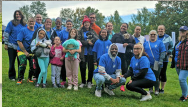
2023 Out of the Darkness Walk for Suicide Prevention