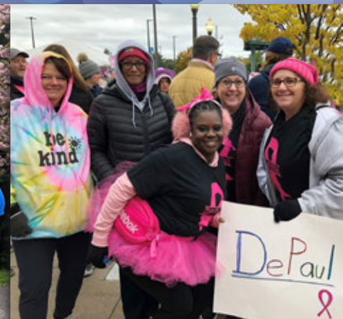
2023 Making Strides Against Breast Cancer Walk