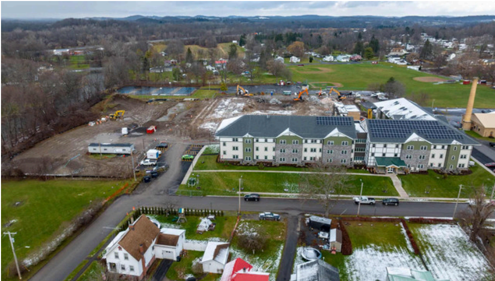
The new Port Byron Apartments complex has 69 affordable apartments, including 30 units that will be eligible to receive on-site support services.

Thirty of the apartments include supportive services funded through the Empire State Supportive Housing Initiative and administered by the New York State Office of Mental Health. On-site staff will help connect residents with health and education services available throughout the county and region.