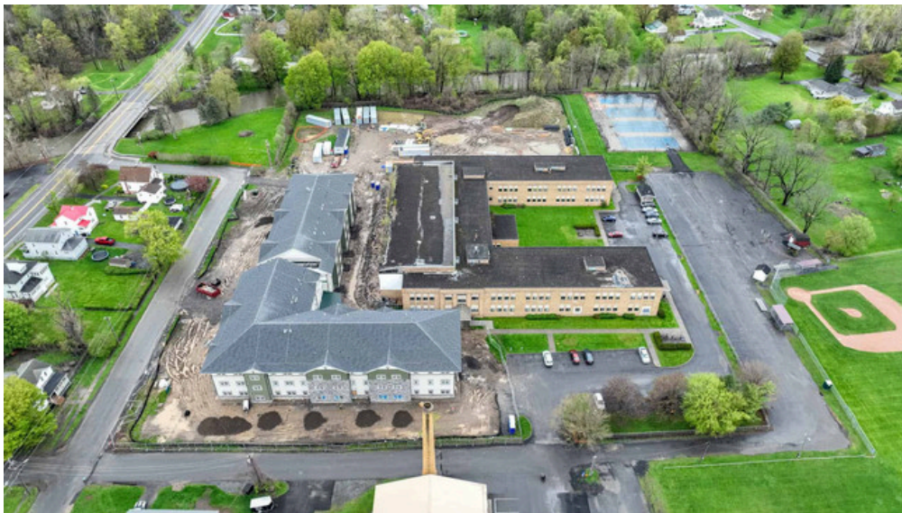
The new Port Byron Apartments complex replaces the smaller, outdated Church Street Apartments complex.

The project involved the construction of a new, three-story building adjacent to an existing 39-unit building known as Church Street Apartments that had previously served as the Port Byron Central School. Upon completion of construction, residents of the older building were moved into the new complex, with the previous building demolished and transformed into an outdoor recreation area for residents.