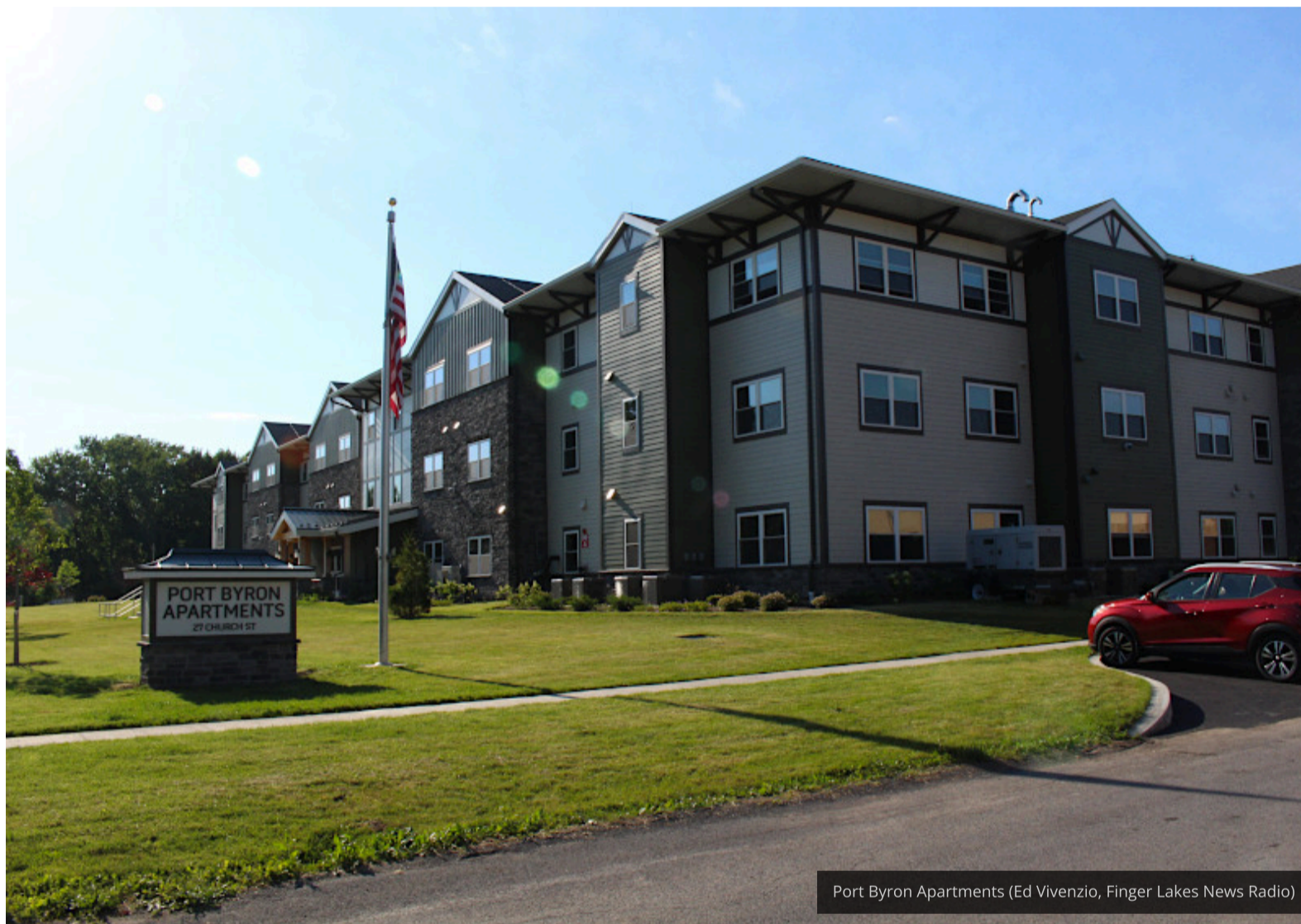
Port Byron Apartments

Thursday was the ribbon cutting for the Cayuga County's newest affordable housing complex. The Port Byron Apartments, located within the Village of Port Byron, features 69 apartments, including 30 that are eligible to receive on-site support services.